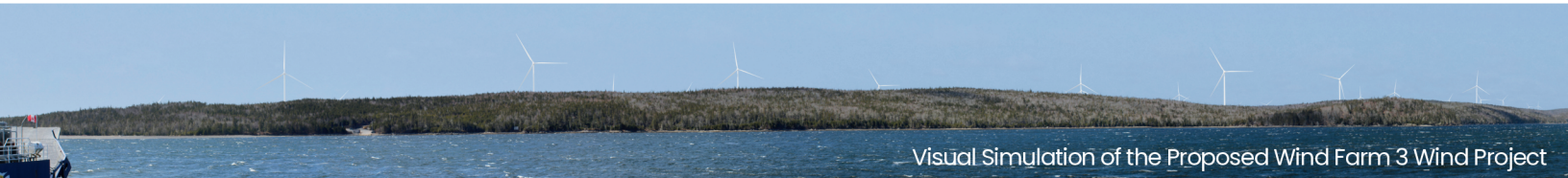
Visual Simulation of the Proposed Wind Farm 3 Wind Project

Wind Farm 3 is part of EverWind's Phase 2 (Guysborough Wind Projects) renewable energy buildout. The Environmental Assessment for Wind Farm 3 is expected to be registered in the summer of 2026.